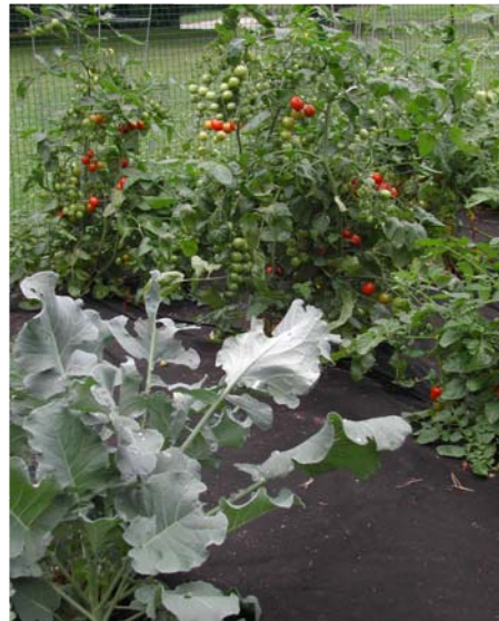
Our Garden of Plenty!!